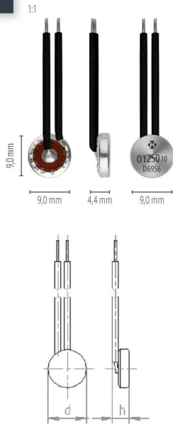
Diameter d 9,0 mm Installation height h from 4,4 mm

Type: Normally closed; high temperature model; resets automatically; with connector cables; without insulation